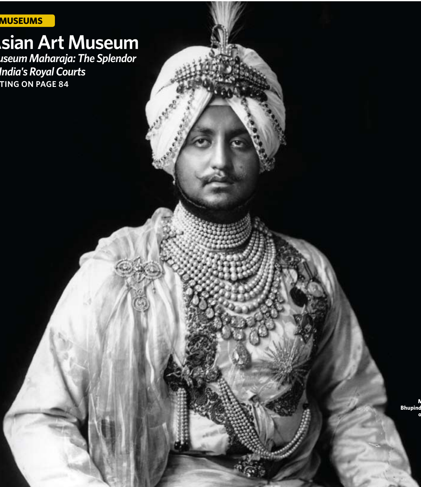
Maharaja Bhupinder Singh of Patiala